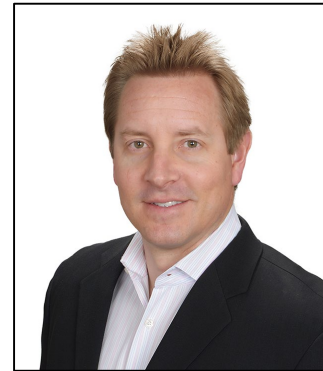
Jacob Johnson Harmon, Inc.