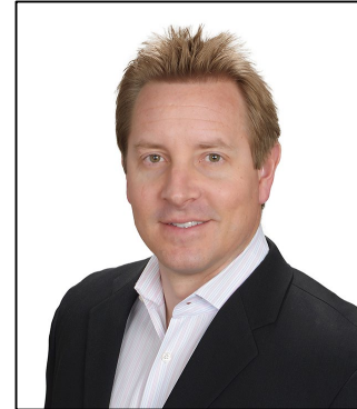
Jacob Johnson Harmon, Inc.