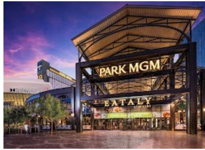
The Park Vegas