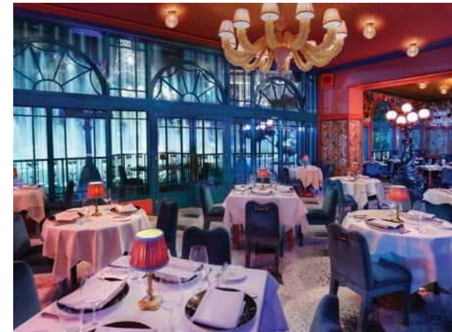
BELLAGIO® LAS VEGAS