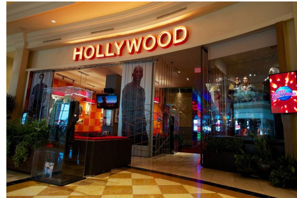
ph planet hollywood®